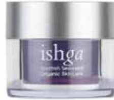
Ishga Anti-oxidant Marine Face Cream £75

An express facial – using Ishga’s organic product range – cleanses, tones and moisturises for essential skin maintenance. The treatment includes an exfoliating mask and scalp massage to complete the experience. (30 mins)