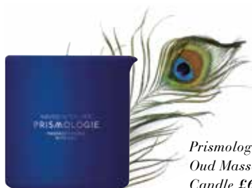
Prismologie Oud Massage Candle £60

For best results book a weekly course of five treatments and receive two FREE.